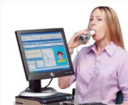
Spirometry- Lung Function Test

Candidates need to arrange for their travel