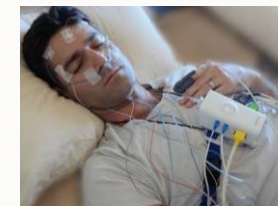
Sleep Apnoea: Polysomnography