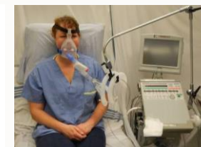
CPAP/Bi PAP for Critical care