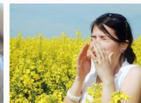
Allergy- Pollen & other allergens